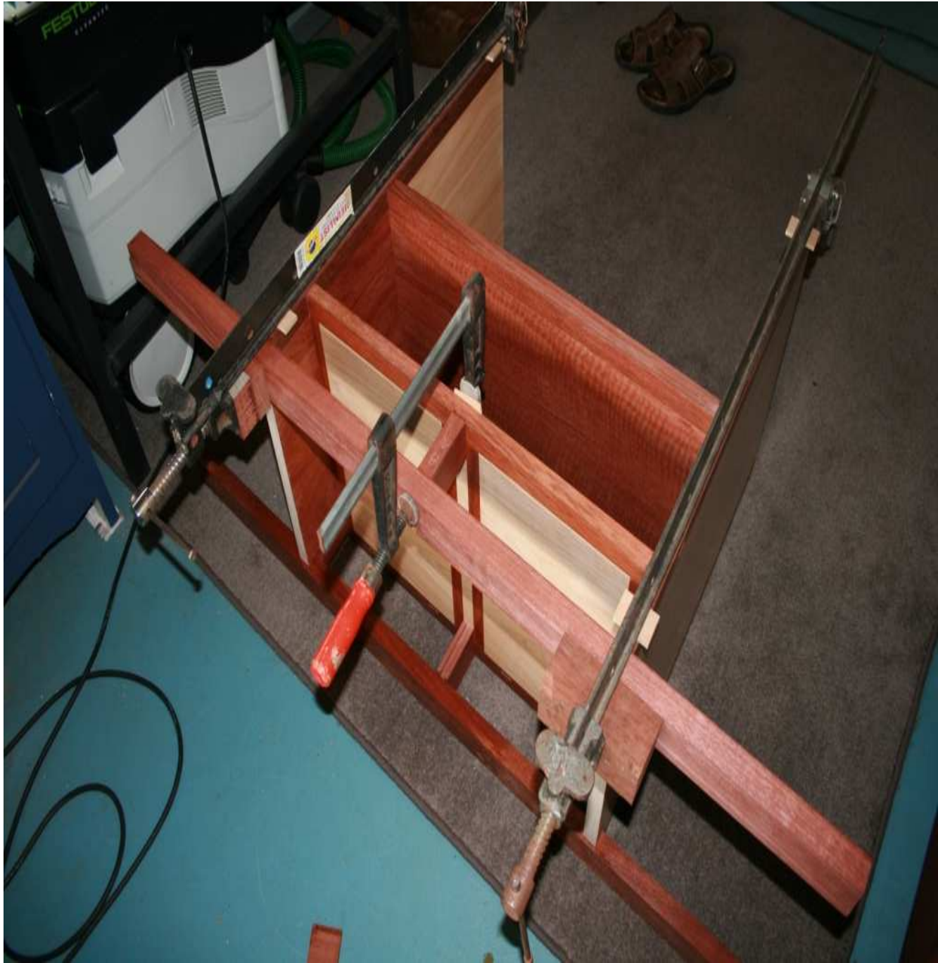
Scotty Horsburgh Yallingup Steading