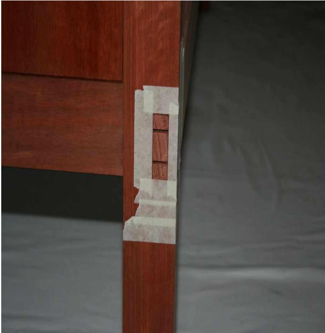
Scotty Horsburgh Yallingup Steading